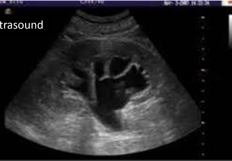
* Kidney Ultrasound