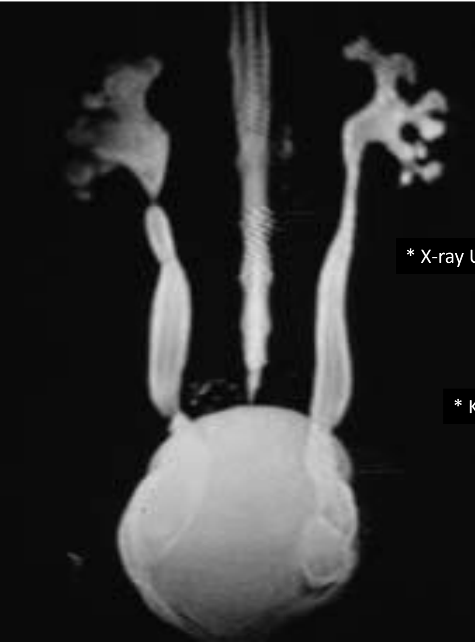
* X-ray Urography